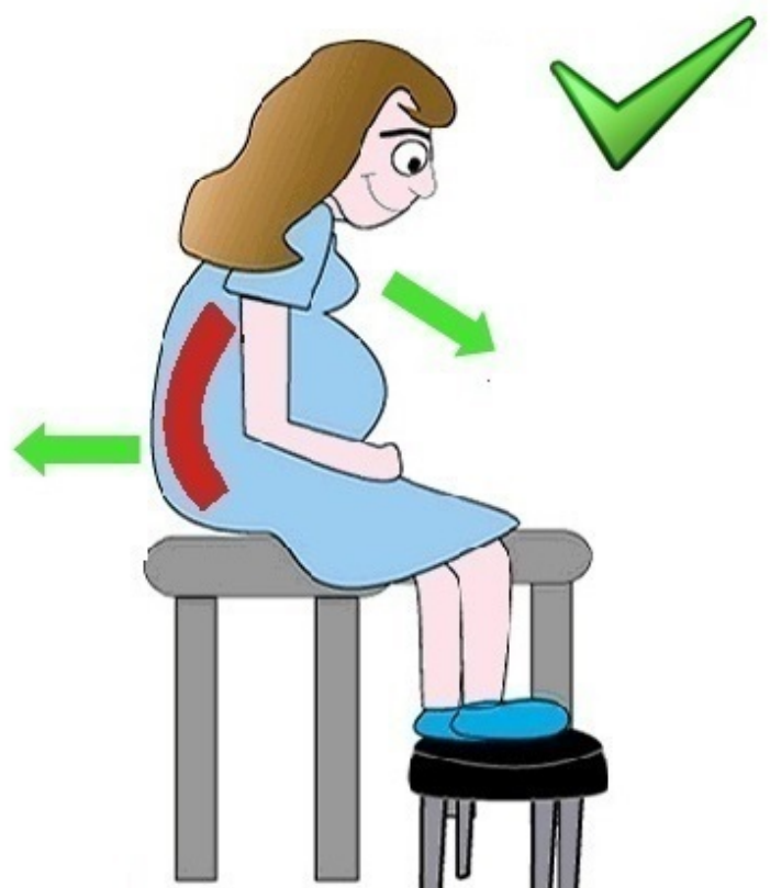
Sturmev, Chambers & McNamara